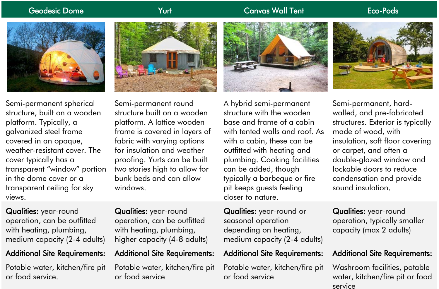
Image Source: Luna-Glamping, Acadia Yurts, Sepaq, Quality Unearthed

In terms of the glamping structure, while there are many options available, the most common types include: